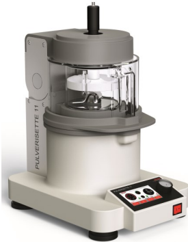
PULVERISETTE 11 Knife Mill