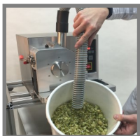
PULVERISETTE 19 Precision Cutting Mill with Cyclone Sample Collection System