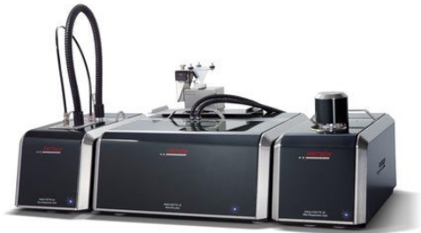
ANALYSETTE 22 NanoTec Laser Particle Sizer